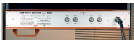
Switches panel (Independent switching for each lamp.)