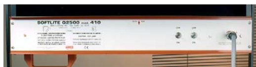
Switches panel (Independent switching for each lamp.)